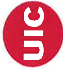
TABLE 1 University of Illinois at Chicago Student Headcount by Student Level - Tenth Day Enrollment Spring Terms 2019 & 2020